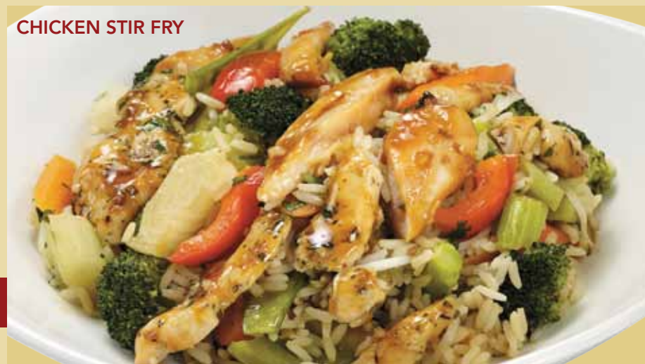
CHICKEN STIR FRY

NOTE: Entrées typically require 24-hour notice.