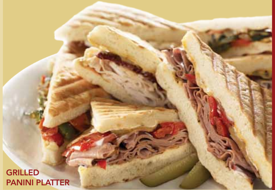
GRILLED PANINI PLATTER

Smoked salmon, light cream cheese and capers, grilled veggies, feta and hummus, black forest ham, sundried tomatoes and Brie, Asiago roast beef and turkey cranberry. (3 pcs each) $12.99 PP (8-person minimum)