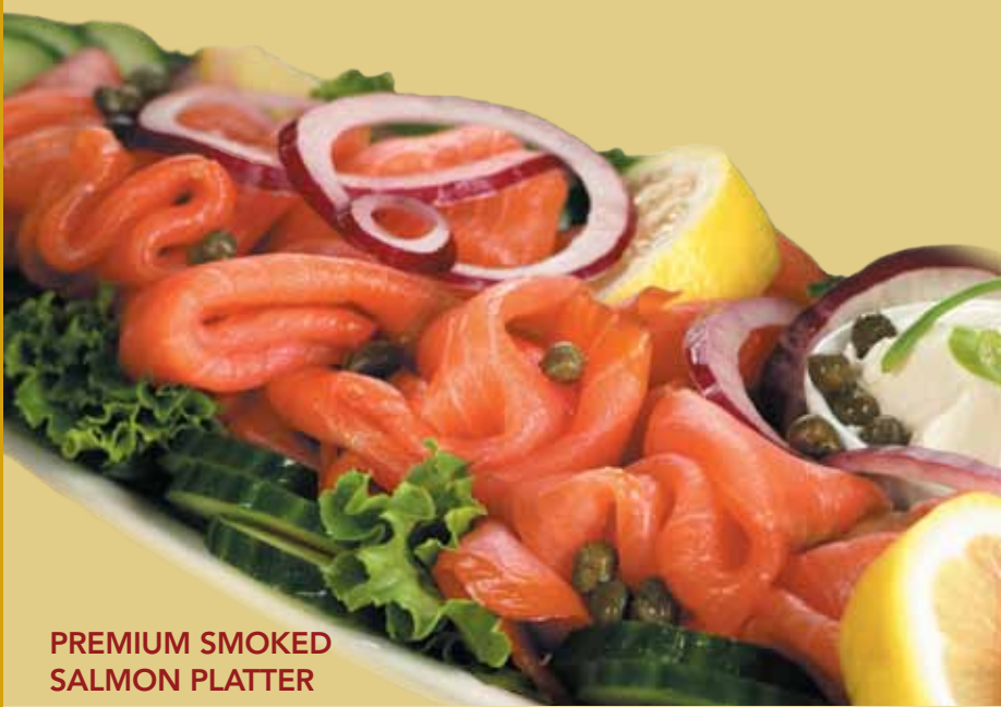
PREMIUM SMOKED SALMON PLATTER